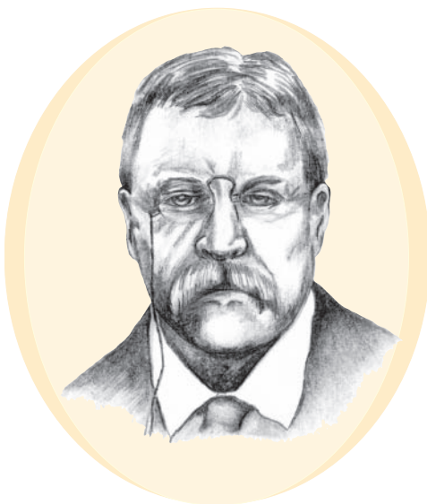
Figure 3 Theodore (Teddy) Roosevelt (1858–1919) was a writer, explorer, naturalist, avid birdwatcher, and twenty-sixth president of the United States. He was the first national political figure to bring conservation issues to the attention of the American public. According to many historians, Theodore Roosevelt contributed more than any other U.S. president to natural resource conservation in the United States.

became president. His term of office, 1901–1909, has been called the country’s Golden Age of Conservation .