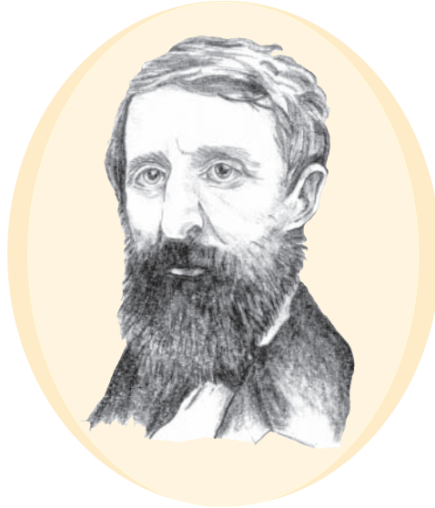
Figure 1 Henry David Thoreau (1817–1862) was an American writer and naturalist who kept journals about his excursions into wild areas in parts of the northeastern United States and Canada, and at Walden Pond in Concord, Massachusetts. He sought self-sufficiency, a simple lifestyle, and a harmonious coexistence with nature.

The U.S. government accelerated this settling of the continent and use of its resources by transferring vast areas of public land to private interests. Between 1850 and 1890, more than half of the country's public land was given away or sold cheaply by the government to railroad, timber, and mining companies, land developers, states, schools, universities, and homesteaders to encourage settlement. This era came to an end when the government declared the frontier officially closed in 1890.