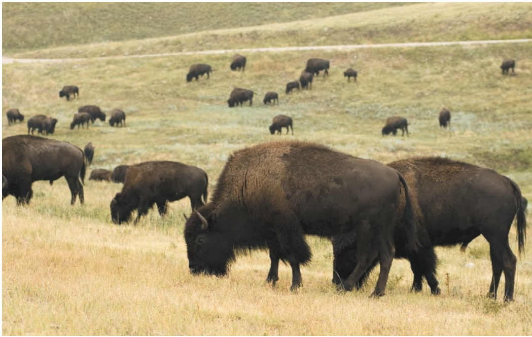
Figure 4 This herd of American bison (also called buffalo) is grazing in Custer State Park in the Black Hills of the U.S. state of South Dakota. This once-abundant land mammal, the largest in North America, has been brought back from the brink of extinction. These huge animals look docile but they become nervous and unpredictable when threatened by a predator, and this can result in a stampede, a frantic rush of hundreds or thousands of panicked animals. A mature bison can toss a grizzly bear off its back, and it can kick like a mule.

relentless slaughter of the bison. As railroads spread westward in the late 1860s, rail companies hired professional bison hunters—including Buffalo Bill Cody—to supply meat to their construction crews. Passengers also gunned down bison from train windows for sport, leaving the carcasses to rot.